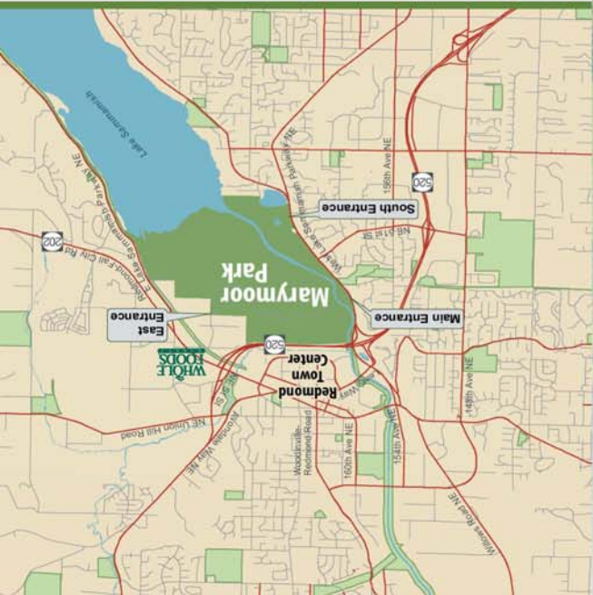
Marymoor Park Vicinity

Marymoor Park 6046 W Lake Sammamish Parkway NE Redmond, WA 98073-3517 By Car Park Hours: 8 am - dusk The bike-Garmin/Sammamish River Trail and the East Lake-Sammamish Trail lead to Marymoor Park and are connected by a trail within the park. Dasani Blue Bikes are available at no cost for use in the park (registration required). By Bus Metro Transit provides service to and along W Lake Sammamish Parkway NE and NE 65th St. East Entrance: From Redmond Way, turn west onto NE 70th St, turn south onto 176th Ave NE and follow to park entrance at 83rd St (1.5 miles north of the park). For routes and timetables, visit http://www.transit.metrokc.gov/ . This map and brochure were produced by CMSS GIS LLC in conjunction with TMRP and King County Parks.